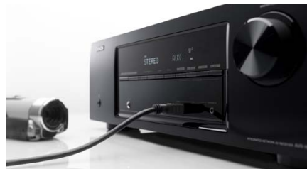
Convenient HDMI port on the front

When you set the Sleep Timer and listen to music before you fall asleep, the AVR-1513 will automatically go into standby mode in the time that you set.