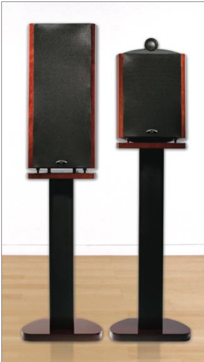
(stands sold separately)