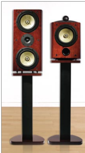
7" Kevlar® mid-bass drivers deliver incredibly realistic sound with a wider soundstage and deeper bass extension. (speaker shown with grilles removed)